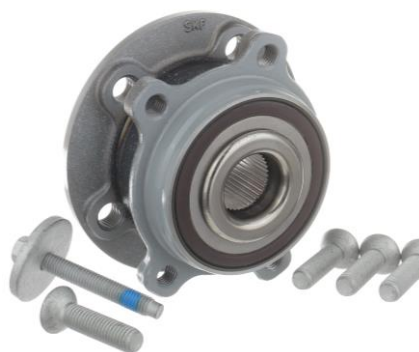
New Kit content