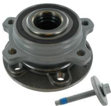
Old Kit content