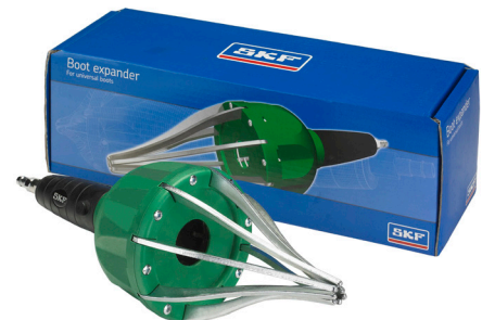
Expander tool: VKN 402

The VKJP 01010 made with stretchy rubber guarantee fast and easy assembly with the SKF air operated expander tool VKN 402, without removing the CV-joint from the shaft.