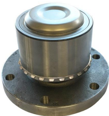
4. Snap ring is in place.