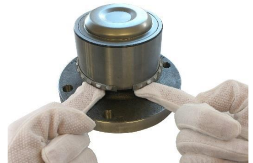
3. Push it back in the right position on the bearing.