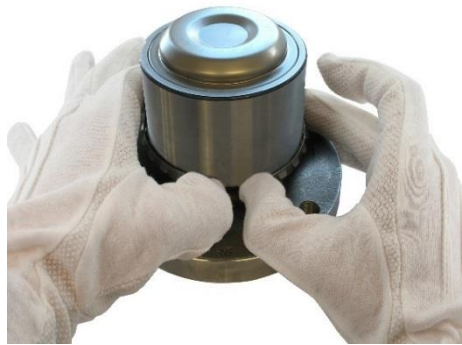
2. Press apart the snap ring.