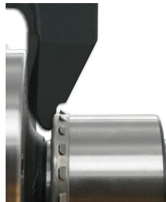
5. Use the SKF mounting tool VKN 600 to fit the bearing.

Click here to watch SKF technical videos on Youtube!