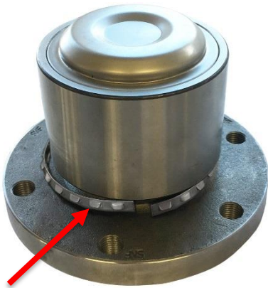
1. Snap ring moved out of position.