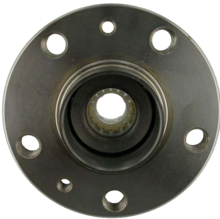
Bearing with plastic Joining sleeve

SKF use safe packaging solutions to protect the wheel bearing from damage during transport or mounting. VKBA 3497 is delivered with a plastic joining sleeve, to keep the inner rings together, until the bearing is mounted on the car.