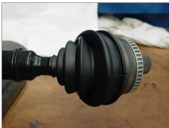
Pic. 3 - Correct position for boot tightening