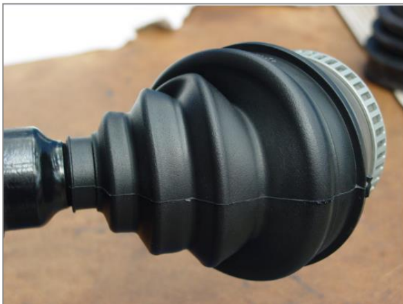
Pic. 1 - Incorrect boot tightening

If the small diameter of the boot is tightened too close to the spline of the shaft, the boot coils may tear. If it's tightened too far (Picture 1), the boot will stretch excessively and will cause cracks (Picture 2).