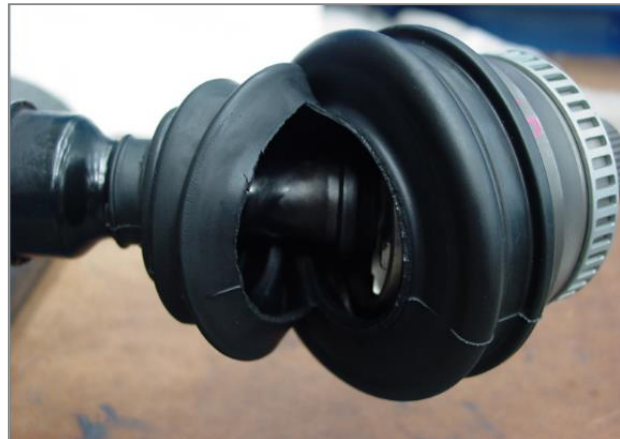
Pic. 2 - Boot cracks due to incorrect tightening