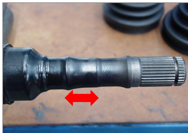
Pic. 4 - Slots for correct boot fitting