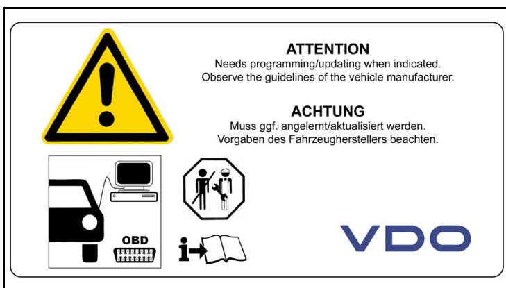
3 - Montage Hinweise / Installation Notes

Nennspannung (Positionssensor) / Nominal Voltage (Position Sensor) = 5 V