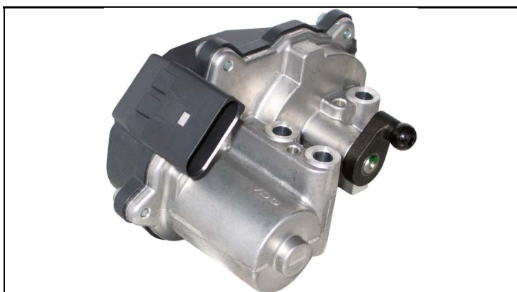
1 - Produkt / Product