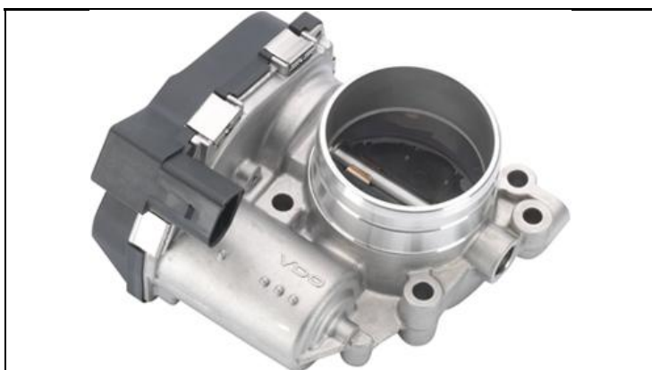
1 - Produkt / Product