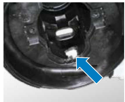
Damage symptoms: Melting traces on the housing (top view into the housing)