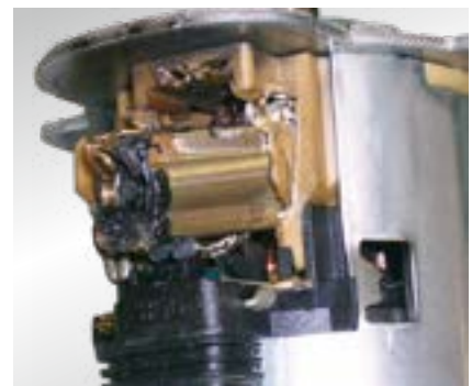
Damage symptoms: Melting traces on the electric motor or the electrical contacts

All content including pictures and diagrams is subject to change. For assignment and replacement, refer to the current catalogues or systems based on TecAlliance.