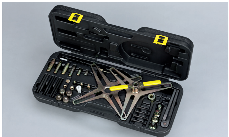
Fig. 2: Special tool 400 0237 10 enables professional clutch repair

Please observe the vehicle manufacturer specifications!