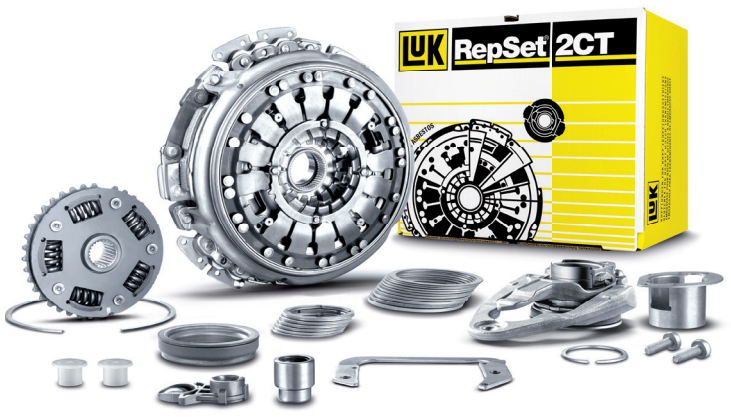
Fig. 2: LuK RepSet 2CT

The table (Fig. 3) compares the previous and new shim sets as well as how they are combined to form the various gauge dimensions.