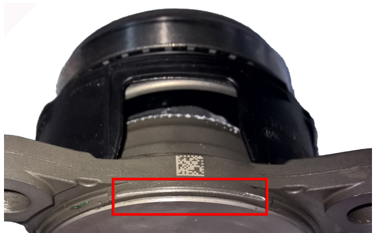
Fig. 2: Damaged concentric slave cylinder with separated gasket