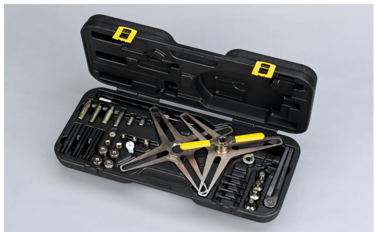
Fig. 1: Special tool 400 0237 10 for clutch assembly