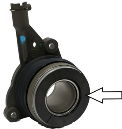
Fig. 1: New CSC version 510 0235 10/11/12 with plastic thrust ring