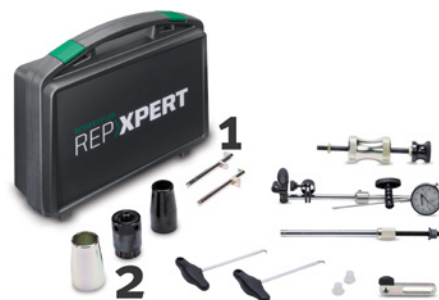
Figure 2: Previous LuK special tool kit 400 0540 10