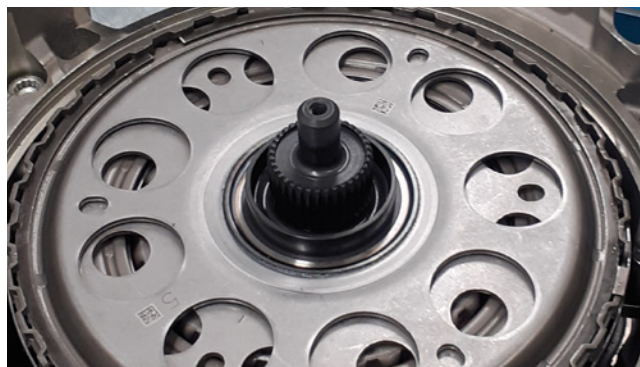
Figure 1: Driving disk with circular openings

A distinguishing feature of the optimized dual clutch variant is the driving disk with circular openings (Figure 1). The previous retaining bolt for the DQ 380/81 and DQ 500 gearboxes (1 in Figure 2) does not fit this version. A modified retaining bolt must be used for assembly. This is now also included in every new LuK special tool kit 400 0540 10.