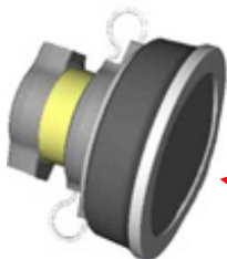
Single release bearing assembly

The 500 1292 40 bearing is used in Safety P.T.O. clutch systems specified by Case-IH, John Deere, New Holland (Fiat) & Steyr.