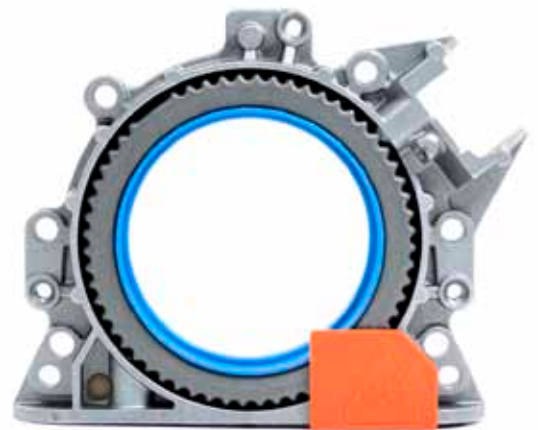
Fig. 1_Integrated radial oil seal

With kind regards Your VICTOR REINZ Service Team