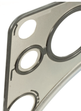
61-34285-20_Even rubber gasket lip