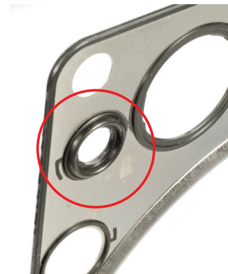
61-37770-00_3 mm higher rubber gasket lip