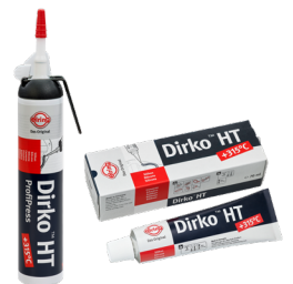
471.501 | 006.553