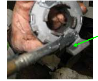
Apply a small quantity of grease