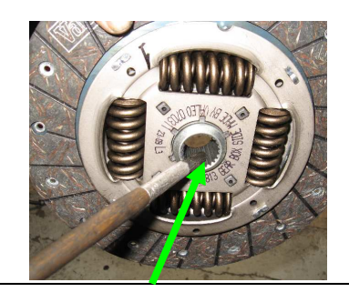
Apply a small quantity of grease