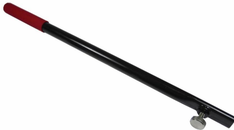
1468-11253 - GAT4939 - Universal Handle for Crankshaft Pulley Holding Tool – To use with GAT5144