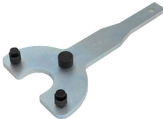
7468-10206 - GAT5144 - Crankshaft Pulley Holding Tool (OE: T10475)