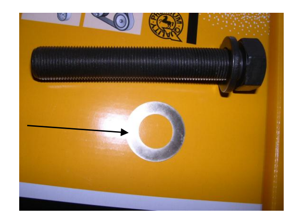
Fig. 1 Washer

In accordance with the updated equipment status, the timing belt kit contains a thin washer (diamondcoated) that was not previously installed in the vehicle.