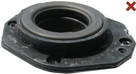
Fig. 1: Suspension strut mount incorrectly assembled

Citroën Berlingo / Xsara / ZX Peugeot 306 / Partner