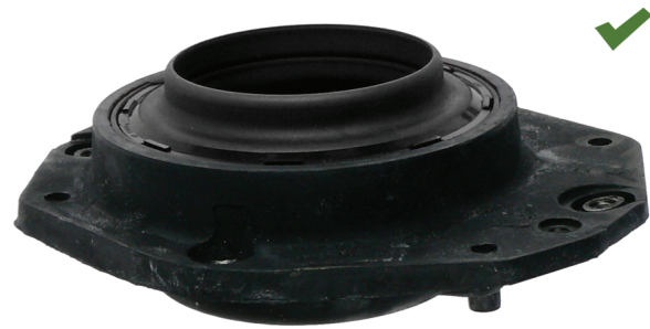
Fig. 2: Suspension strut mount correctly assembled