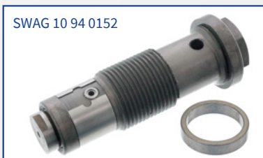
SWAG 10 94 0152

The measuring chain tensioner must not remain in the engine after testing. It is only a testing tool! Replace chain tensioner SWAG 10 94 0152. The chain tensioner previously fitted must not be reinstalled.