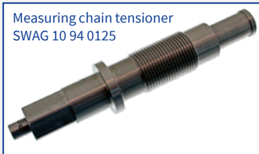
Measuring chain tensioner SWAG 10 94 0125

The measuring chain tensioner has a graduated scale from 55 to 85. If all chain drive components, e.g. chain tensioner, chain, guide rails and sprockets, are in perfect condition, the measuring chain tensioner should indicate a value of approximately 62.5.