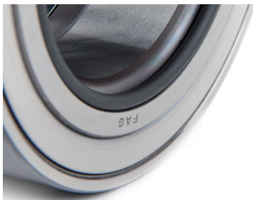
Fig 2: Truck Hub Unit with o-ring

The key difference can be seen on the bearing inner ring. Some bearing units have an o-ring (Fig. 2) on the inner face, where other bearings have a beveled or rounded edge (Fig. 3). The following table lists the feature and the installation orientation of the bearing units.