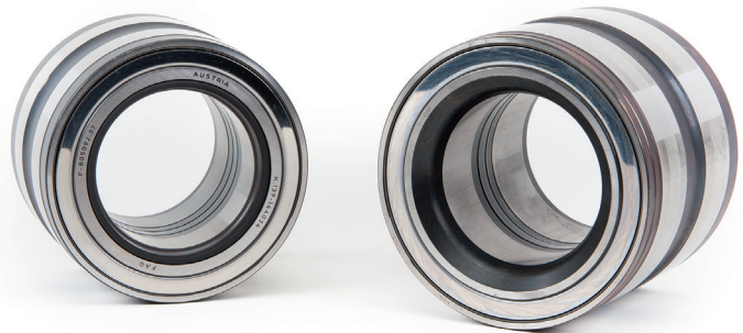
Fig 1: Truck Hub Unit with seal ring (left) and beveled edge (right) on the bearing inner ring

Part No.: 805003CA.H195 805011C / 805011.03.H195 805012.06.H195 805092.07 / 805092.07.H195 571762.01.H195 803194.26 / 803194.26.H195 805003A.H195