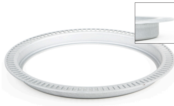
Part No. 434 0579 10 fits the wheel hub of the new design

The two different wheel hubs use different ABS sensor rings, however. When replacing the ABS sensor ring, it is important to identify the visual differences in order to assign the correct ring to the correct hub.