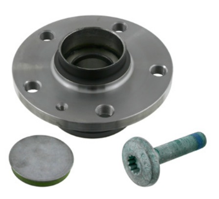
febi wheel bearing kit (23320)

The new bearing assembly and the wheel speed sensor were fitted to the car, along with the refitting of the brake assembly and wheel. Once this was completed, the steering wheel angle sensor reset could be carried out. This consisted of road testing the vehicle with an assistant to operate the diagnostic tool. This involved driving straight at no less than 20 km/h, turning the steering wheel at least 15° to the left and then to the right and then stopping the vehicle. Then, the steering was turned completely to the left and was held for at least 3 seconds, then