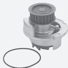
febi 18691 for the 1.8l engine