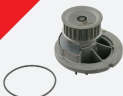
febi 24314 for the 1.4l and 1.6l 16V engine

In any case, however, you must replace the water pump!