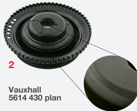
Vauxhall 5614 430 plan

For more technical information please visit: partsfinder.bilsteingroup.com