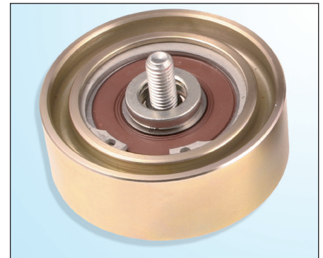
Fig. 2: 532 0294 10 (new Version)

As part of the ongoing development of our products, we have changed the bearing surface of idler pulley 532 0294 10 from plastic to metal.