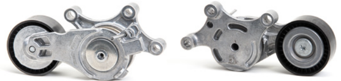
Figure 2: New design

As part of our continuous efforts to improve our products, modifications have been made to the belt tensioner with part number 534 0075 20.