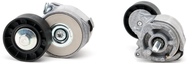
Figure 1: Old design

For current listing refer to catalogue media