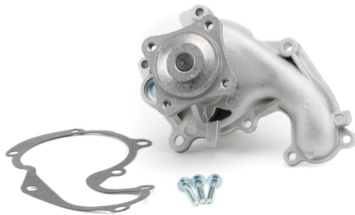
Fig. 1: Contents of the coolant pump package

For current listing refer to catalogue media