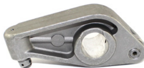
If there is wear to the Rocker bearing surface or Hydraulic Lifter tip, replace component.